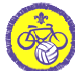
Health & Fitness