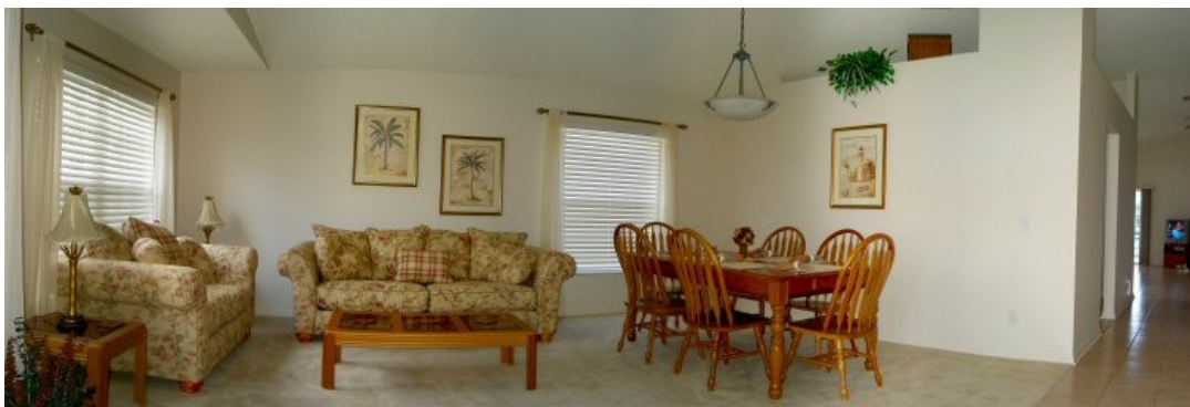
The Living / Dining Room

The Living / Dining room is at the front of the house and is 19 by 17 feet in size. This is a slightly more formal room and again there is a cathedral ceiling enhancing the feel of spaciousness. There are two sofas, one of which converts to a sleeper. There is a large dining table and chairs.