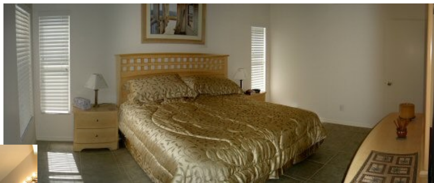
Master Bedroom ....

The main bathroom is sited adjacent to the second and third bedrooms.