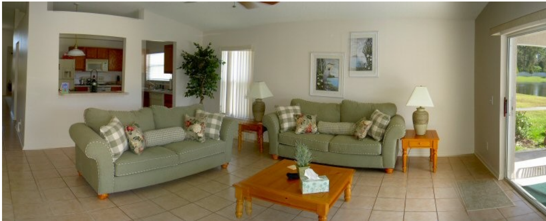
The “Great” Room

The Living / Dining room is at the front of the house and is 19 by 17 feet in size. This is a slightly more formal room and again there is a cathedral ceiling enhancing the feel of spaciousness. There are two sofas, one of which converts to a sleeper. There is a large dining table and chairs.