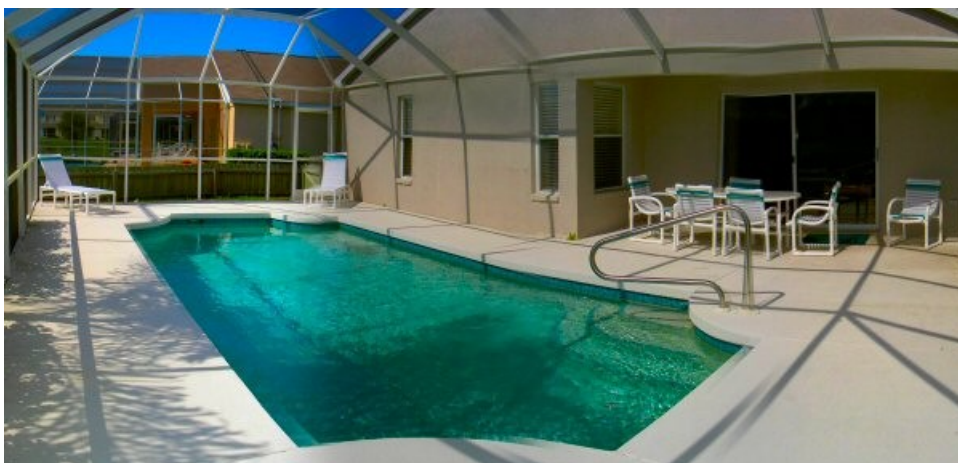
Pool and patio area

The whole area is fully screened, so you can relax without worrying about bugs flying around.