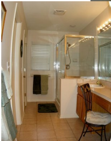
.... With ensuite bathroom