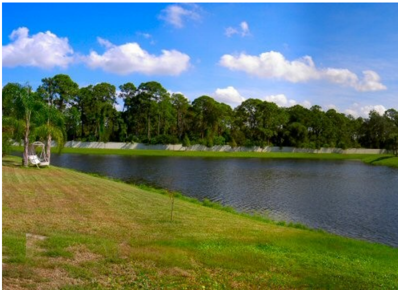
Magnificent view of the lake at the rear

Well this describes our villa on the Gulf Coast of Florida!