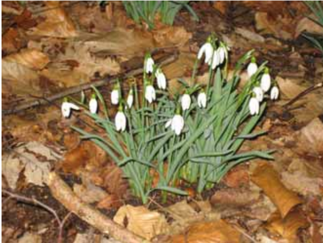
Snowdrops in the woodland

Phone Martlesham Parish Council 01473 612632